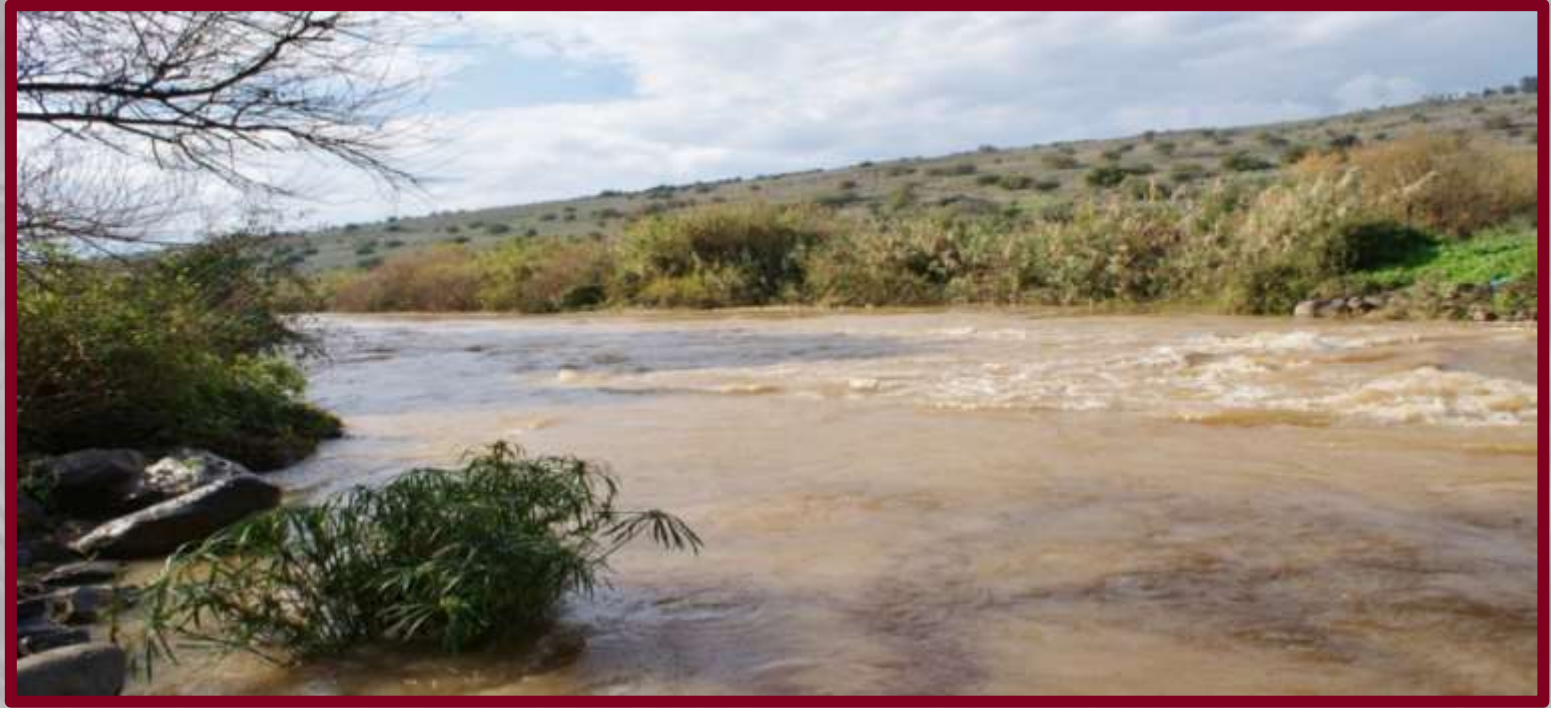
The River Jordan

prophet. “Then he went down, and dipped himself seven times in Jordan, according to the saying of the man of God: and his flesh came again like the flesh of a little child , and he was clean. And he returned to the man of God, he and all his company , and came, and stood before him: and he said BEHOLD , now I know that there is no God in all the earth, but in Israel”.